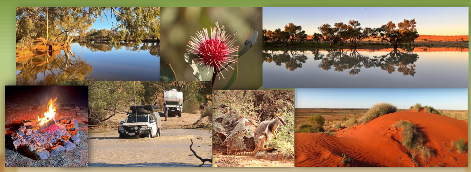
Have a 4WD but just not sure where to go? Why not join us on our exclusive Full Day Tag along Tours in the Flinders Ranges! It's a great way to get a glimpse of the Flinders Ranges exploring its ancient geology, abundant local wildlife, railway history and historic ruins. There's nothing like having local & passionate guides to show you around and take you to the spots many others miss!!